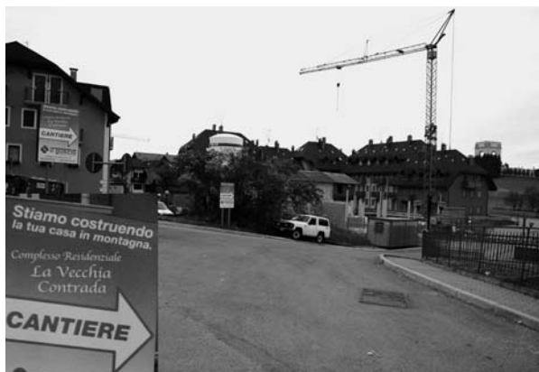
Fig. 4: New vacation housing in Asiago (Sette Comuni Plateau). In the sign-board (enlarged in the foreground left) the new complex is presented as “La Vecchia Contrada”, that is the old type of settlement called contrada (in the reality it is very different).

According with these changes, the traditional system of self-sustained economy has completely collapsed and has been replaced by a more open economy integrated with that of the large diffuse city of the plain. This is evident, considering that most of the fodder to breed the cattle and the pigs, and of the poultry-feed are imported in the mountain area from outside. So a much larger bio-