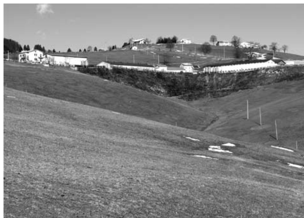
Fig. 3: Large cowsheds of a modern cattle farm of the Monti Lessini near Bosco Chiesanuova. The old contrada is hidden behind the large hangar-like buildings (centre of the photo).

- the opening of large industrial quarries of limestone utilized as ornamental stone (Bondesan & Meneghel, 1991).